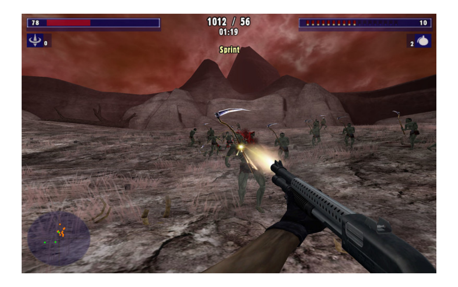
Kuso - Soundtrack Vol 1 Collector's Content Download] [Keygen]

Download ->->-> <a href="http://bit.ly/2SLau7r">http://bit.ly/2SLau7r</a>